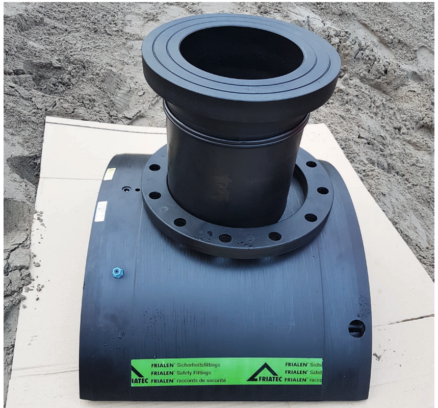
Fresh from the Aliaxis production facilities in Mannheim – SA XL d710 with DN250 flange outlet

Tapping will make use of a 195 mm Hütz & Baumgarten Perfekt-3 drill, which generates little swarf. The tapping rod is 1.6 m long.