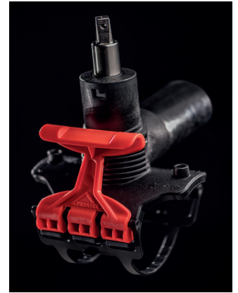
Fast and simple installation: The new FRIALEN DAV with extra long outlet spigot and fast clamping lever RED SNAP.