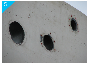
after removing the formwork