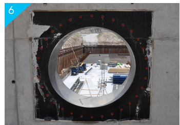
Clean the sealing surface and remove the plugs