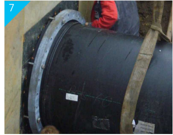
Fitting the connecting line

Once the connecting line has been fitted, the Aliaxis Deutschland wall penetration may be put into service.